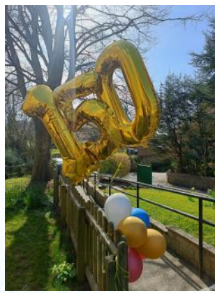
Photos from our 150th Birthday celebration on Monday 31st March.